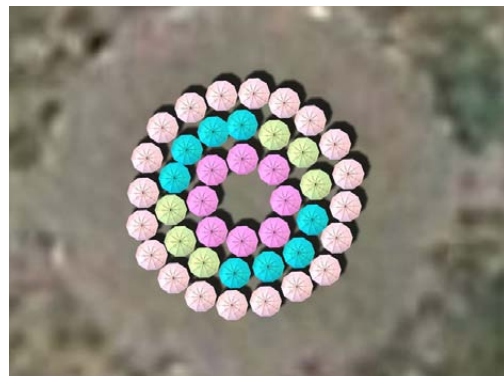
Aerial views created with Photoshop, to get a feel for the dimensions.

But meanwhile, it was becoming clear that we should not only have just the presentation of installation, since that would be a too short event to generate publicity for: 15 minutes max, my soundscape included. So like we had learned in Vietnam, we could organize a 'festival' around it: with some performances by the students of both schools. Also the idea surfaced to make a kind of choreography with the umbrellas before hanging them in the installation. There are dance classes at both schools (that also double as activity-centre for learning judo, using internet, doing aerobics or as library) and the teachers of both schools are enthusiastic to cooperate.