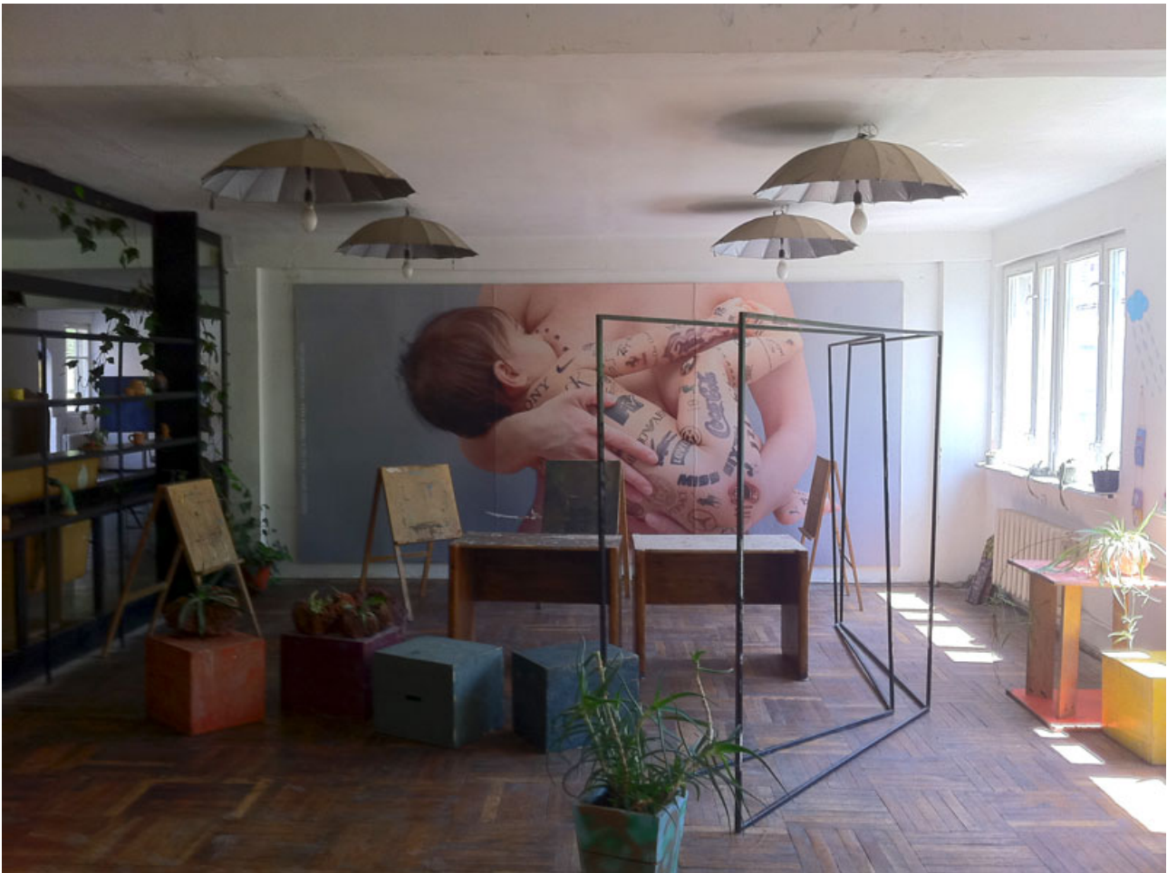
Inside the art school, there's proof of creative thinking....