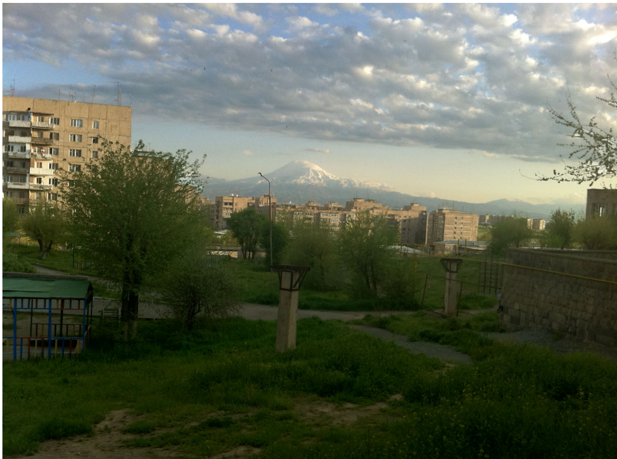
View of Bangladesh from our residency with mythical Mount Ararat in the distance, sadly for all Armenians in Turkey.