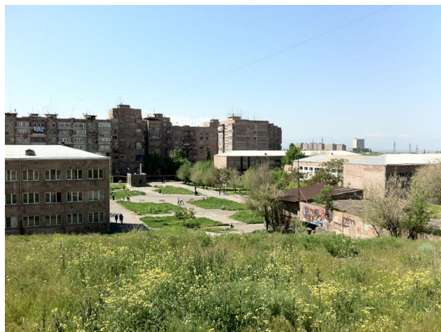
An aerial view on the left shows the giant sizes of both schools. On the right, the area as seen from the north.