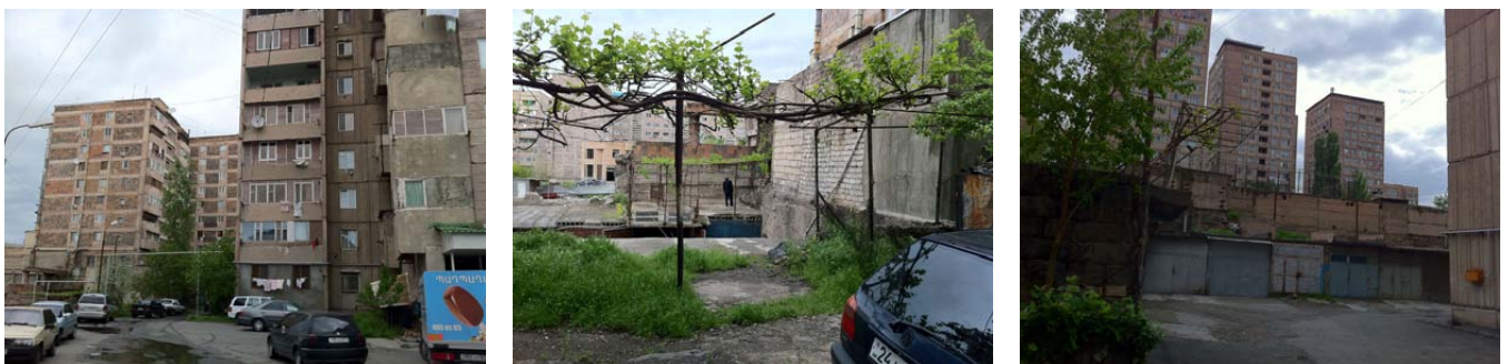
A mixture of concrete and green, in some places well looked after

Our residency is located quite far from the center in the southwest and (therefore) the area is oftentimes referred to as “Bangladesh,” also due to the high level of poverty among the more than 140,000 residents living there. To the uninitiated, indeed the Soviet-style flats seem not very inviting, there's trash in the street in some places and wild dogs run among it. Potholes in the road, weeds on both sides and a constant exhaust of bad Russian cars.... But if you take away the Western interpretation of ‘ghetto’, you see different things: people are neatly dressed and well behaved, there's not so much noise and the green is actually is quite charming, since there are many places where there's no green at all.