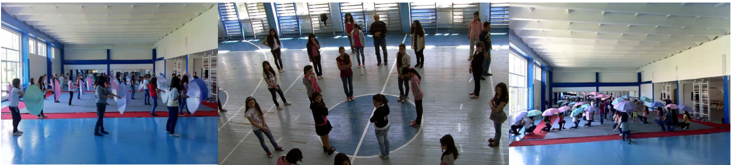
Practicing with the choreography and the umbrellas.