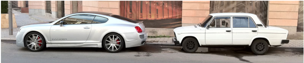
In Armenia there's almost no middle-class

Modern day Armenia is by many standards a country in transition: its economy is changing from a centrally planned economy to a free market, but also politically, it is opening up to democratic principles. On paper, it is already a democratic republic, but a 2008 report by Freedom House still calls it a "Semi-consolidated Authoritarian Regime". In that year, during protests against the elections, police killed at least 10 people and censorship took hold of the media. The Freedom of the Press index ranks Armenia 146 (on a total of 195). According to these rankings, Armenia is called “not free”.